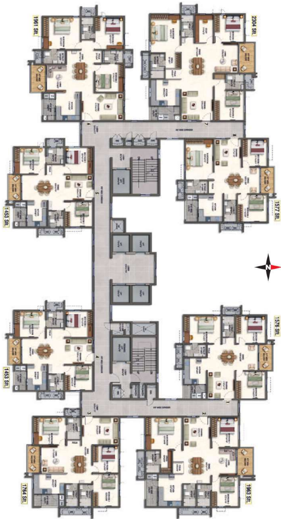
Floor Plan Block - A, B, C, D, E, F & H