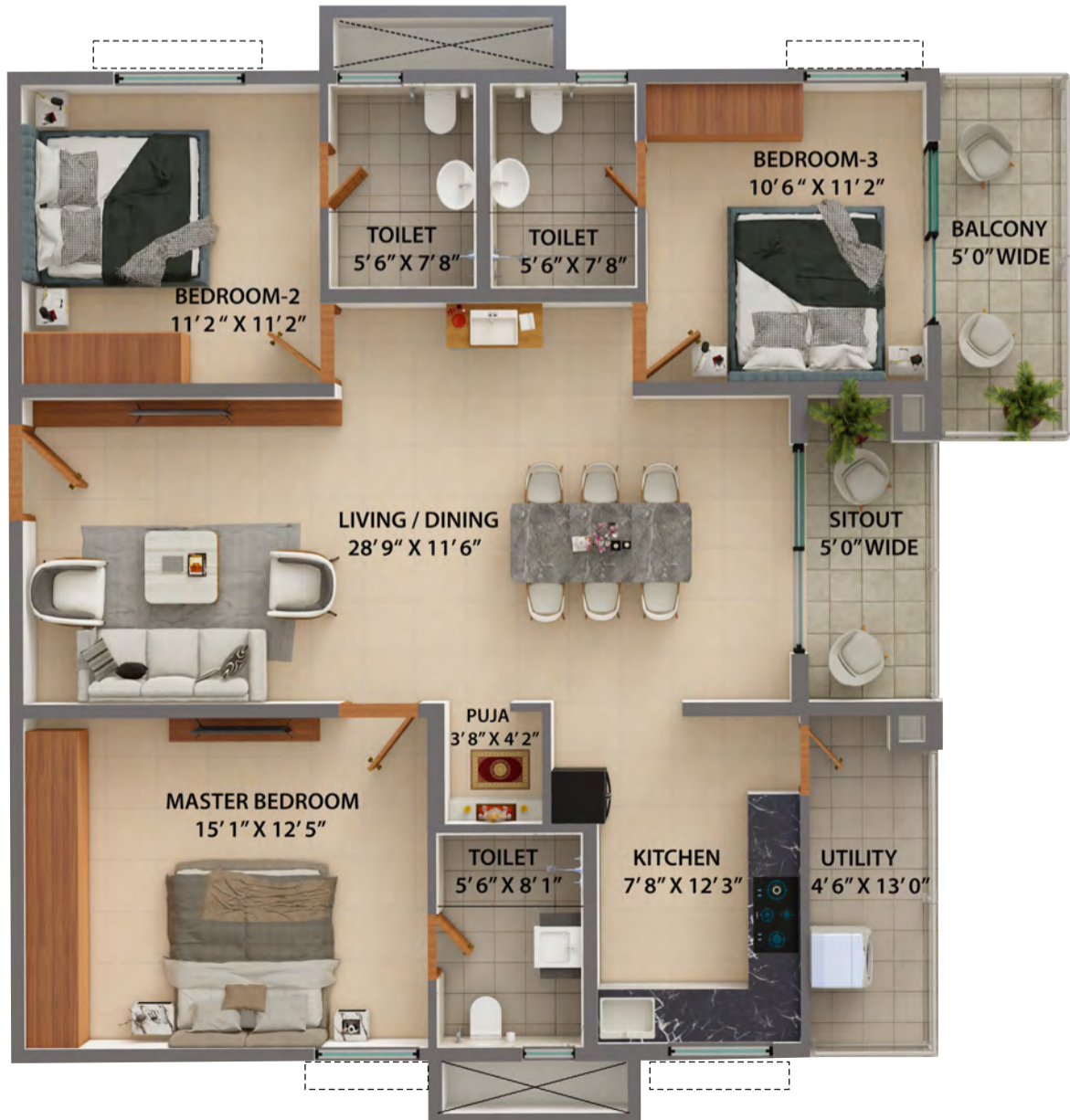
TYPE - 5A : WEST FACING 3 BHK - 1745 SFT.