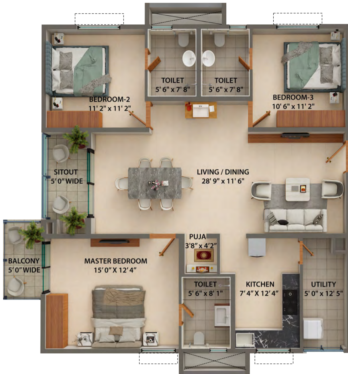
TYPE - 5 : EAST FACING 3 BHK - 1720 SFT.