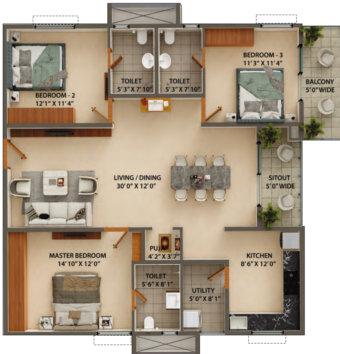
TYPE - 2A : WEST FACING 3 BHK - 1815 SFT.