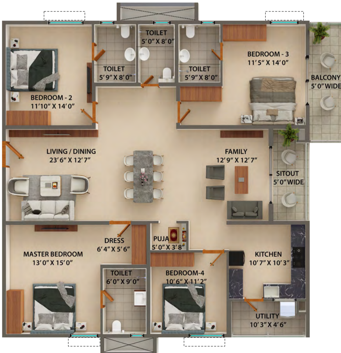
TYPE - 1A : WEST FACING 4 BHK - 2460 SFT.