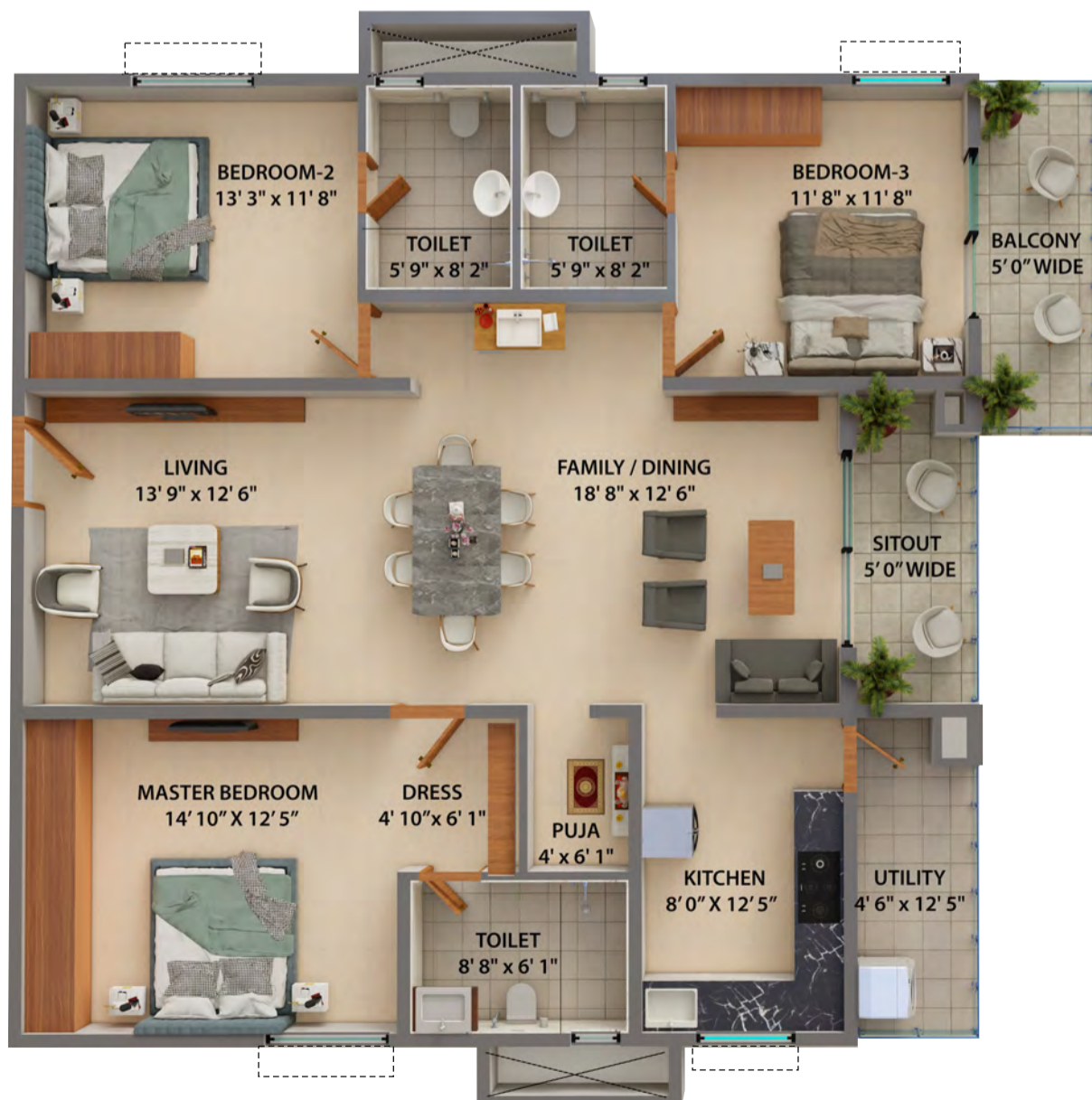
TYPE - 3A : WEST FACING 3 BHK - 2000 SFT.