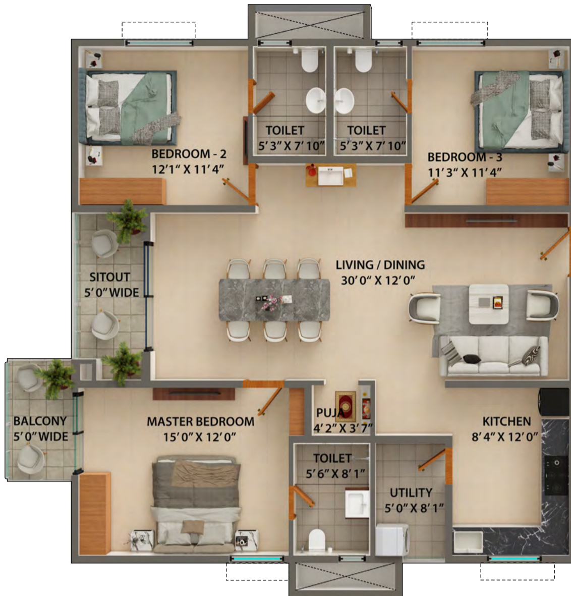
TYPE - 2 : EAST FACING 3 BHK - 1780 SFT.