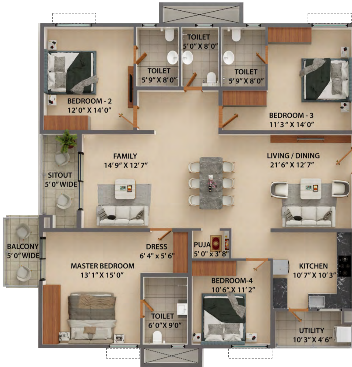
TYPE - 1 : EAST FACING 4 BHK - 2415 SFT.