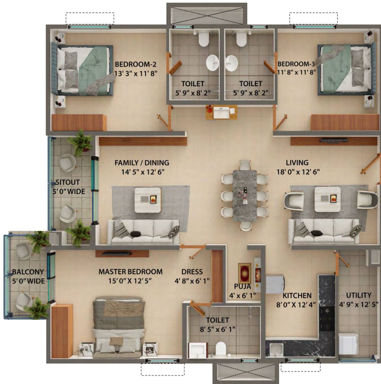
TYPE - 3 : EAST FACING 3 BHK - 1970 SFT.