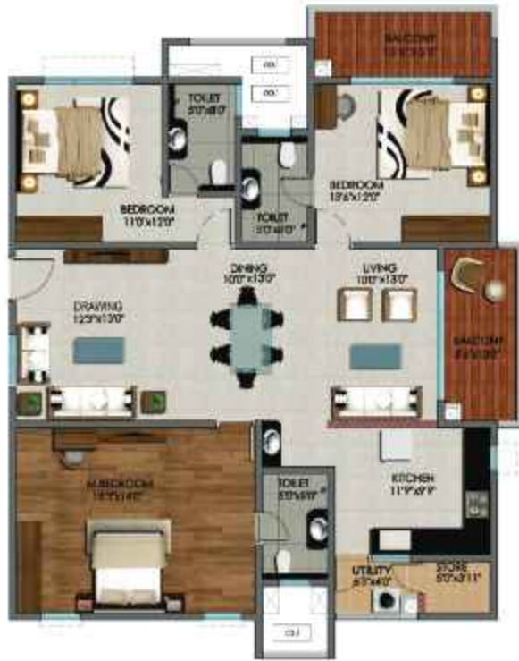
3 BHK, 2000 sft - West