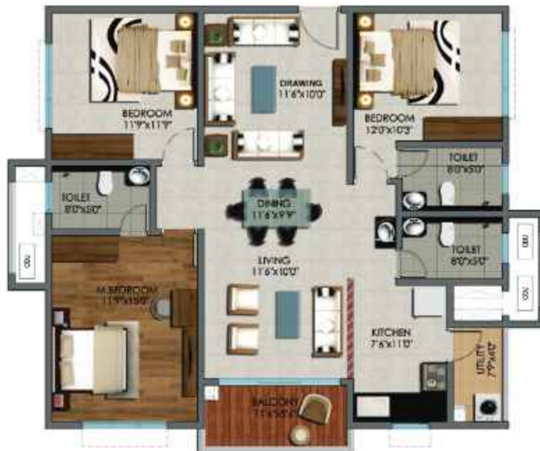
3 BHK, 1600 sft - North