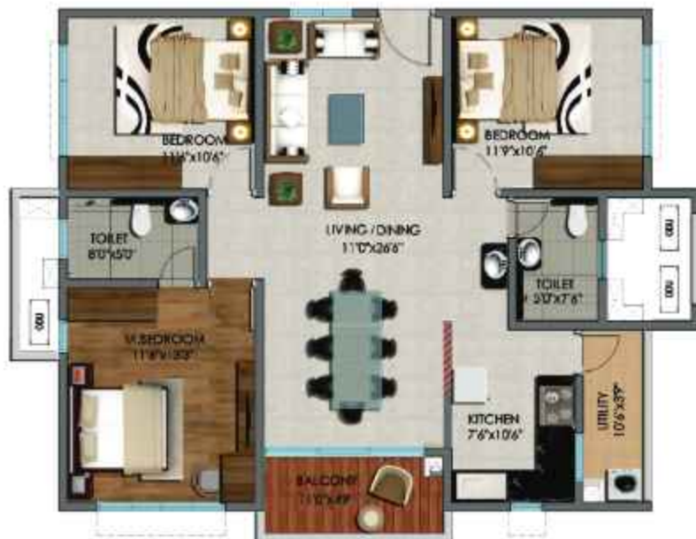
2+1 BHK, 1400 sft - North