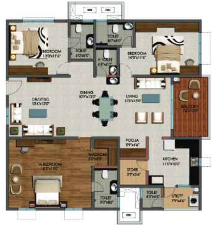
3 BHK, 2220 sft - West