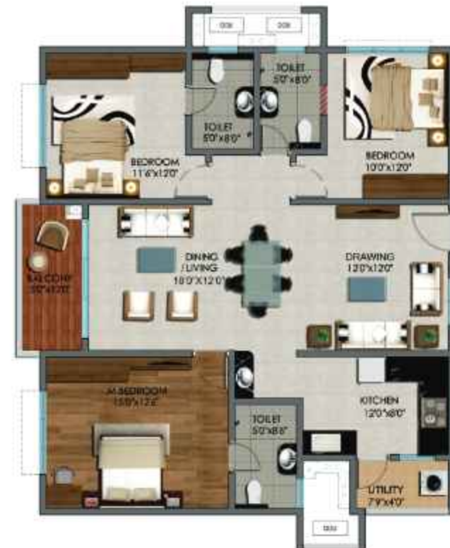
3 BHK, 1650 sft - East