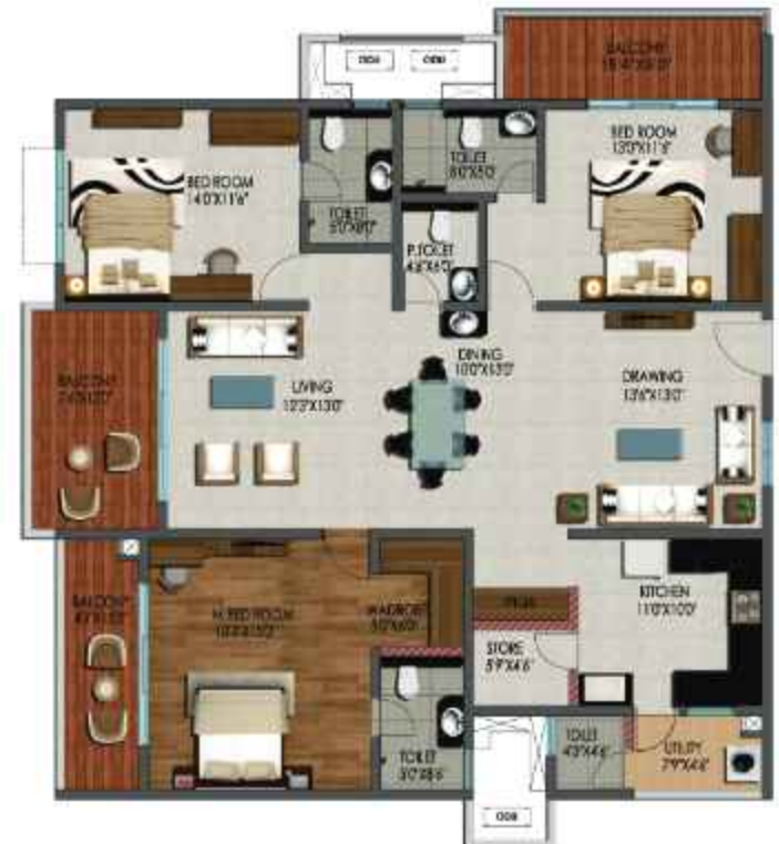
3 BHK, 2340 sft - East