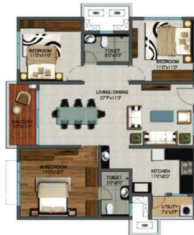
2+1 BHK, 1450 sft - East