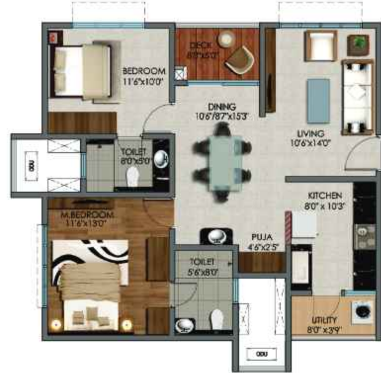
2 BHK, 1160 sft - East