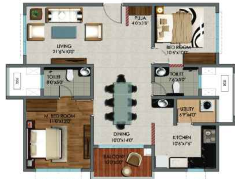
2 BHK, 1210 sft - North