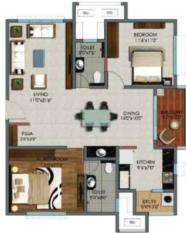
2 BHK, 1250 sft - West