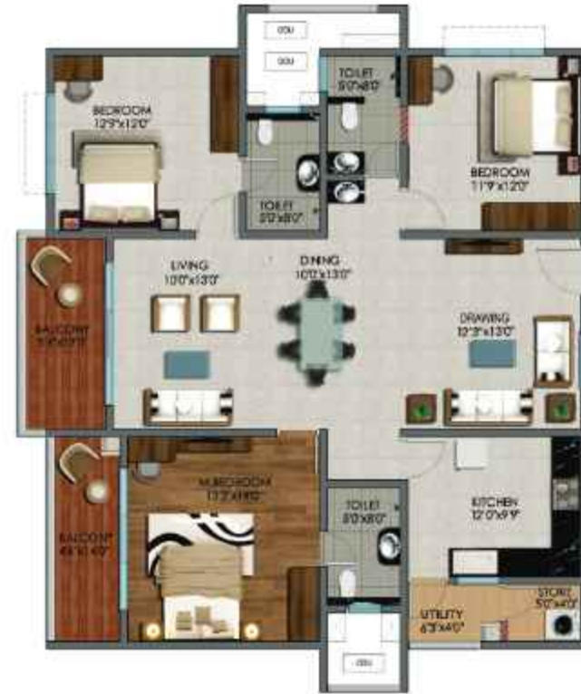
3 BHK, 1900 sft - East