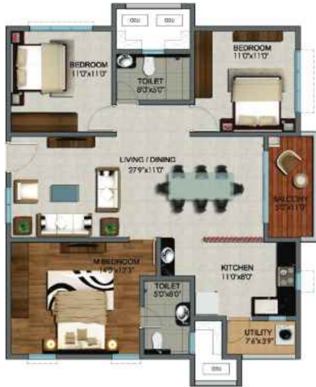
2+1 BHK, 1450 sft - West