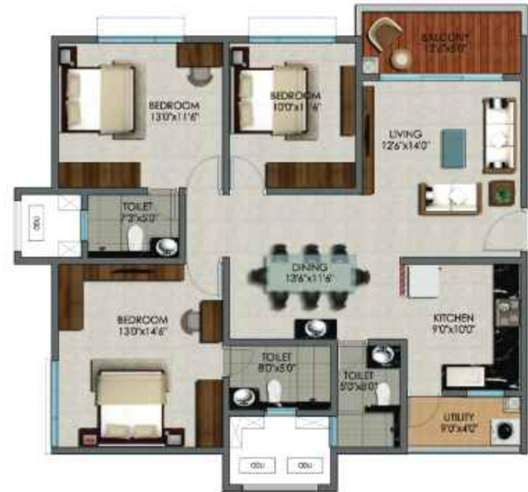
3 BHK, 1550 sft - East