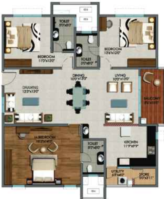
3 BHK, 1900 sft - West