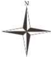
Duplex Upper Level