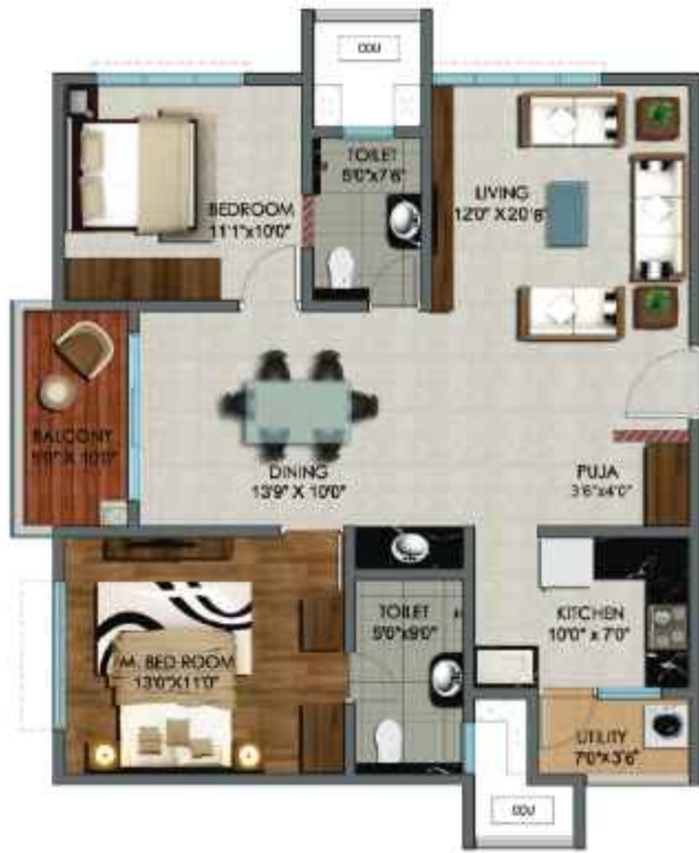
2 BHK, 1250 sft - East