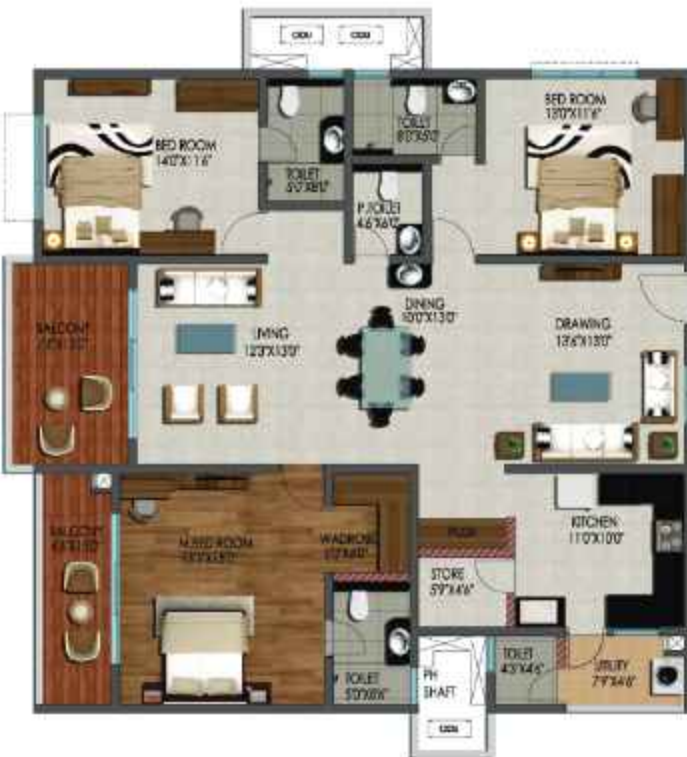
3 BHK, 2230 sft - East