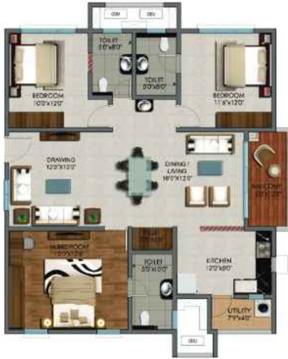
3 BHK, 1650 sft - West