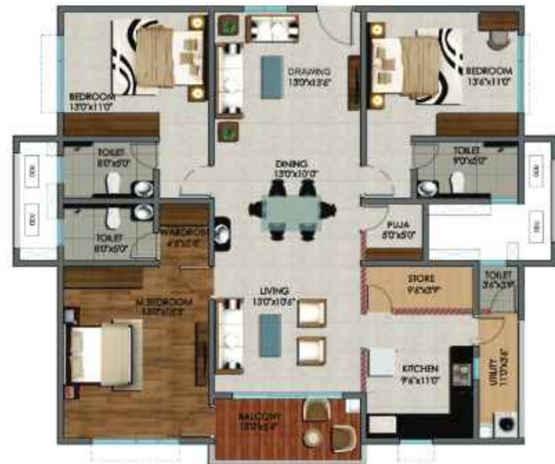
3 BHK, 2000 sft - North